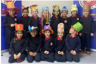
Junior Infants modelling their Hata Mata's

On Monday, pupils were given the opportunity to talk about the Maths Week poster and were encouraged to ask and answer questions based on the information that was on the posters. On Tuesday, the junior classes solved questions based on the school grounds through maths trails while the senior classes were challenged to write their own maths questions based on photos, they had taken around the school grounds. On Wednesday, the children in the junior classes played games such as What Time is it Mr Wolf? , Hopscotch and Cone Game to reinforce the topics of time, number and colours while classes in the senior end were paired to play board games. On Thursday, all classes took part in Mathsletics. This involved children working in pairs to compete against each other to answer 10 maths questions that were displayed in the school yard in a timely manner. First pair to return their answer sheet with all questions answered correctly won the competition. On Friday, children brought in their Hata Mata entries, and every class was invited to the hall to showcase their creations. To conclude the week, two pupils from each class were awarded with maths week certificates for their learning in maths throughout the week.