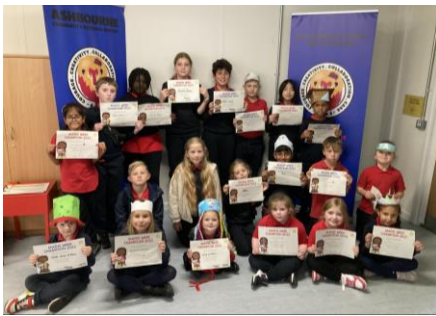
Mathematicians of the Week Winners