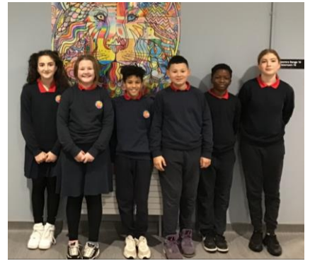
Pupil Members of the Action Team for Partnership.

We have lots of exciting goals planned for 2024 some of which include our first ever school bookfair, class trips the local library and hosting an intercultural day at ACNS. We can't wait to share more information with you about these initiatives in Term 2.