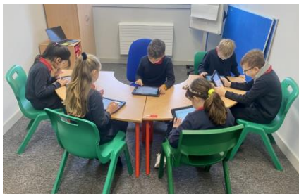
2 nd Class pupils completing their Wellbeing Surveys

As some of you may be aware as part of our School Self-Evaluation, we are focusing on wellbeing. Last year, we surveyed pupils, staff and parents on their thoughts and ideas about wellbeing in ACNS. This year, as we settle into our new surroundings and welcomed lots of lovely new pupils, we felt it was prudent to re-issue the survey to get more current insights on wellbeing within our school.