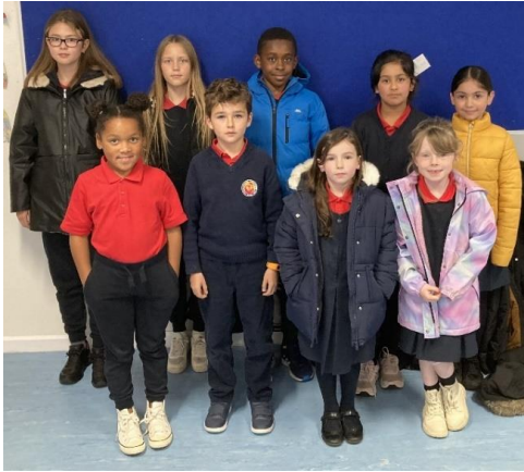
Pupil Members of the Green School Committee

Our Green Schools Committee welcomed two new members from First Class for the second year of working on the litter and waste theme. The Committee have been extremely busy since we started back to school in September from organising a Green Schools Code competition, to an October bin competition, from monitoring and assessing bin usage to keeping our school grounds litter free.